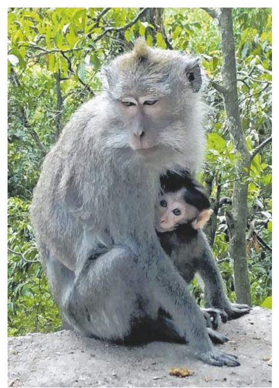
Monkeys in Lombok.

That means you must go with the flow if your driver runs a little late and try not to plan